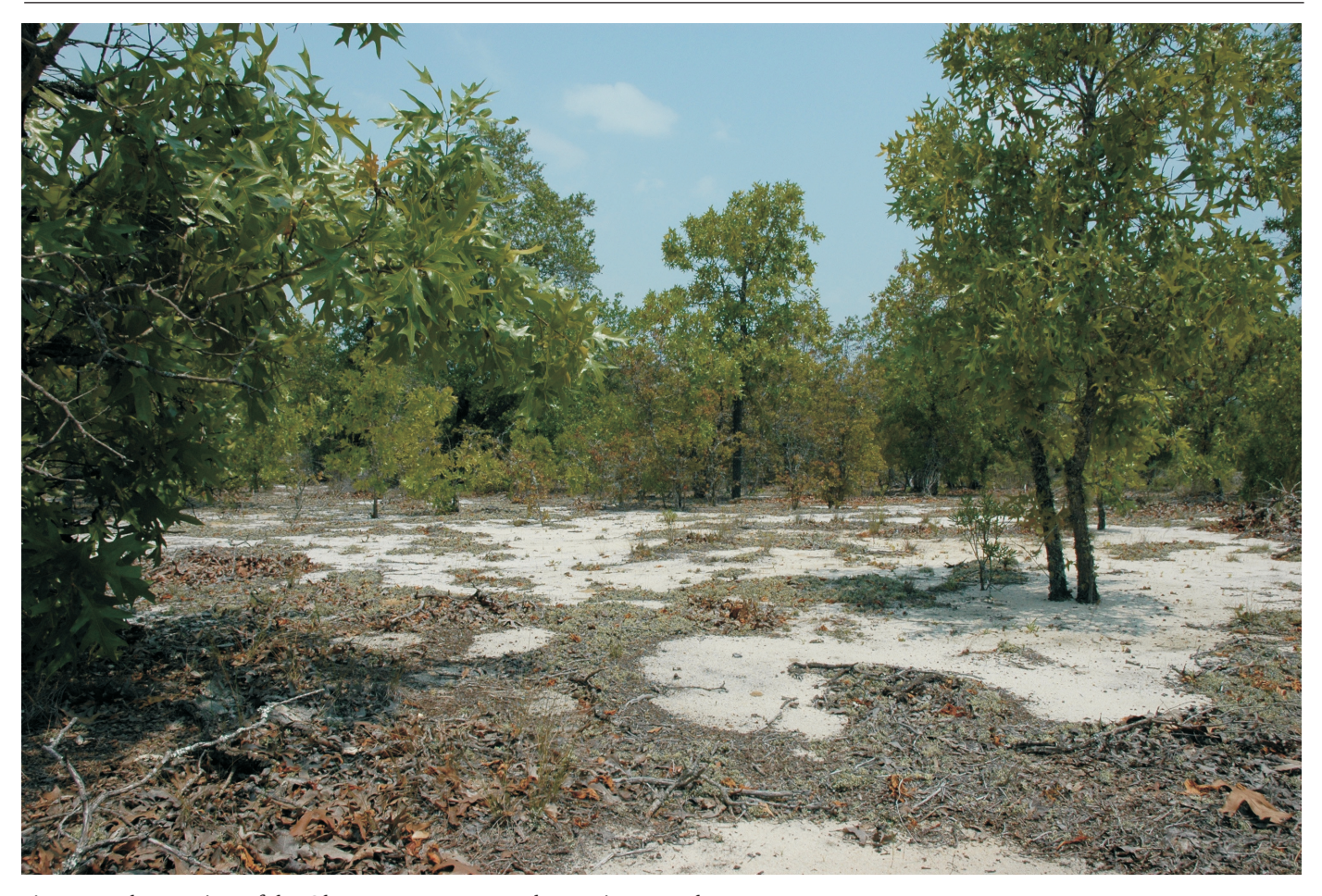
Fig. 1. Landscape view of the Ohoopee Dunes. For color version, see Plate I.

fauna of the Ohoopee Dunes was surveyed with the goal of providing baseline data for conservation efforts and for future ecological studies.