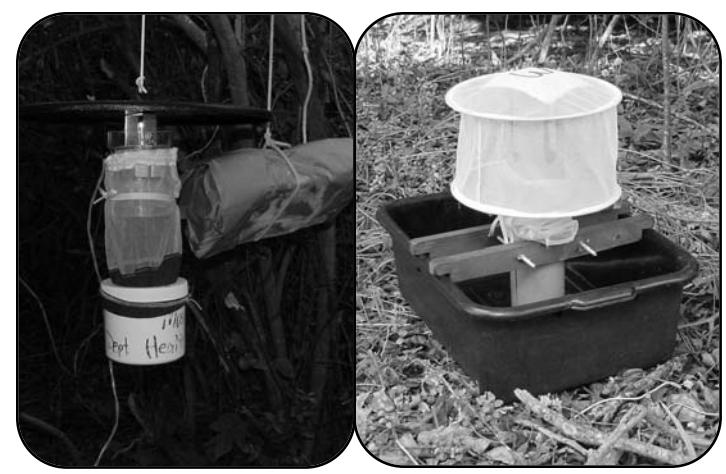
Figure 4. CDC light trap with dry ice as a carbon dioxide source.