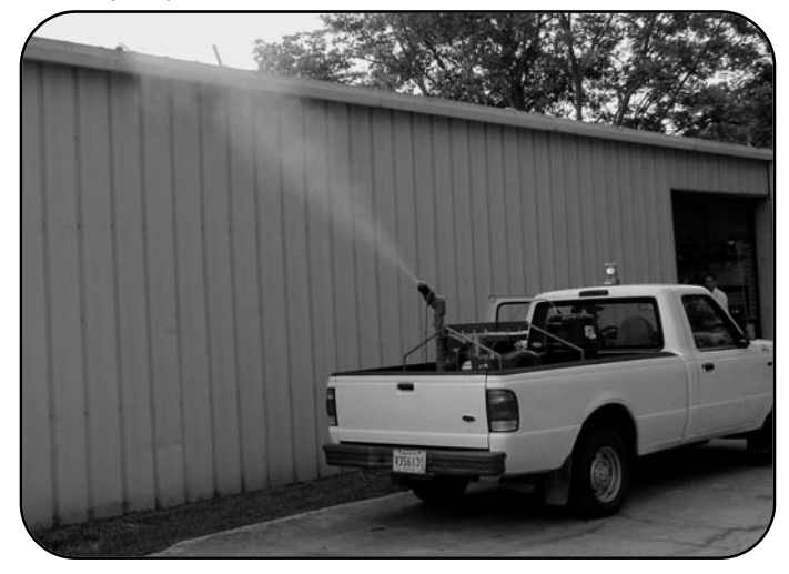
Figure 6. ULV applicator showing the fine mist as it leaves the nozzle.