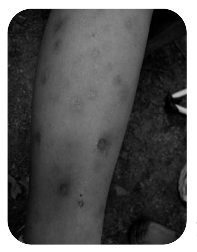
Figure 1. Temporary wounds as a result of feeding by female mosquitoes.

Not only is the bite irritating, it can transmit disease. Mosquitoes are the sole transmitters of yellow fever (virus), dengue/dengue hemorrhagic fever (also known as break bone fever, which is a virus), and malaria (protozoa) in countries around the world. Although yellow fever and malaria were rampant in North America at one time, the diseases have been practically eliminated from this area.